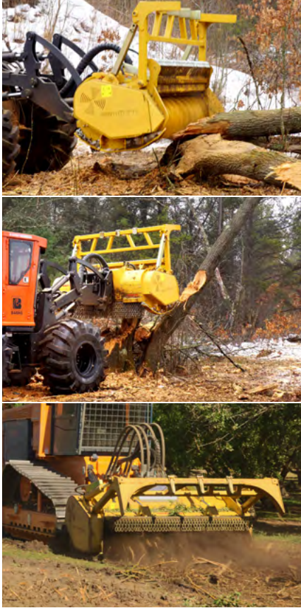
► YouTube www.youtube.com/seppimulcher